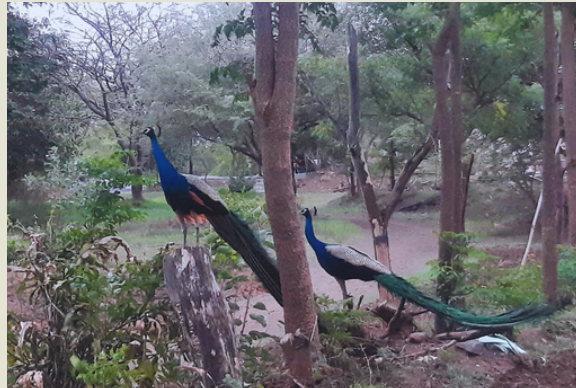
The presence of a peacock on the farm enhances the diversity of the farm's inhabitants.

This farm incorporates diverse breeds of cows, a biogas facility for cooking, and pits for producing Jeevamrut (indigenous fertilizer - a mixture of cow dung, cow urine, jaggery, gram flour, and curd) meeting soil deficiency from Electrical conductivity(EC)