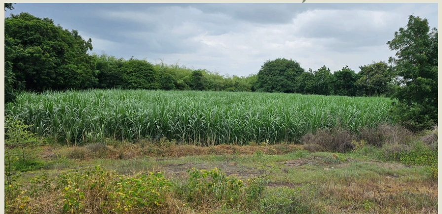
The farmland is surrounded by forest and houses a hyena den within the sugarcane crop.

Regenerative agriculture relies on natural processes and living things to create food, but often changes the environment around it. While farms can be managed in ways that minimize their damage to the environment around them, industrial agriculture’s focus on productivity means that too many farms are disruptive to wild species both near and far. When environments are too altered or polluted by industrialized agriculture, vulnerable species may lose their habitats and even go extinct, harming biodiversity. In anticipation of the formidable task of feeding a global population approaching 11 billion by 2050, farms and ranches face the imperative to redouble efforts in sustainably enhancing productivity.