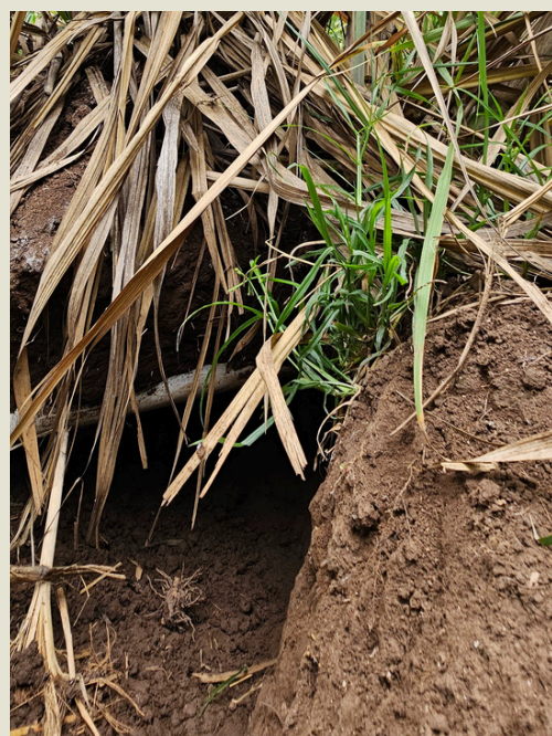
Hyena Den in sugarcane field