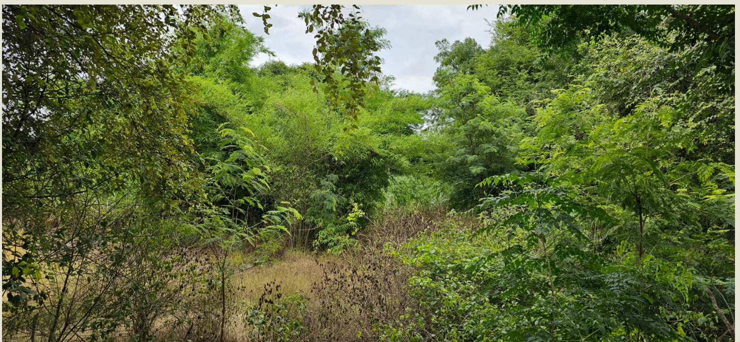
"Enveloped by a diverse array of native bamboo species, the forest contributes to a vibrant and ecologically rich environment within the Samrutivan landscape."